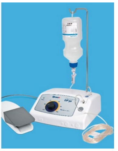
With ON/OFF foot switch